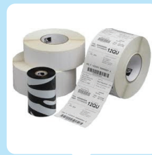
Consumables (labels, ribbons, PVC cards)